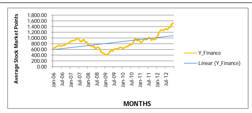
Figure 1.Time-Series Plot of the Philippine Financial Stock Index from January 2006 to December 2012