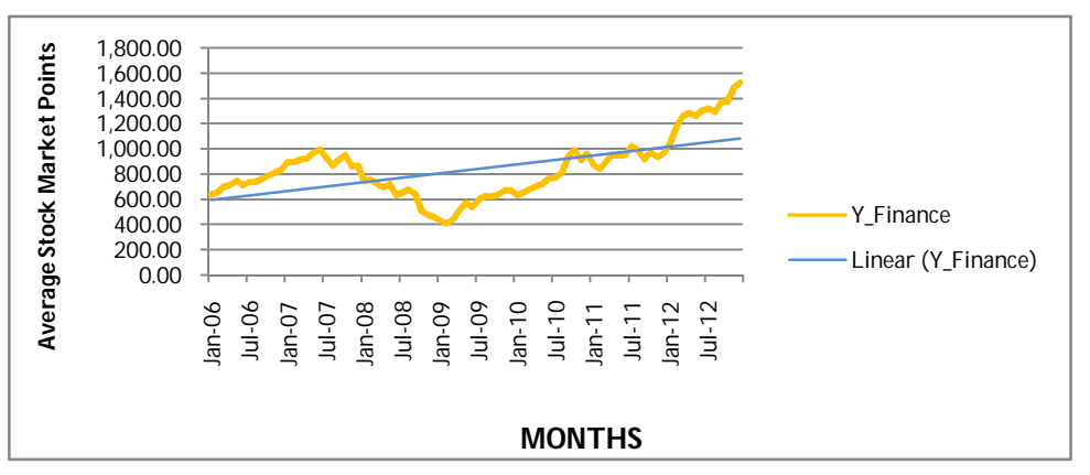
Figure 1.Time-Series Plot of the Philippine Financial Stock Index from January 2006 to December 2012