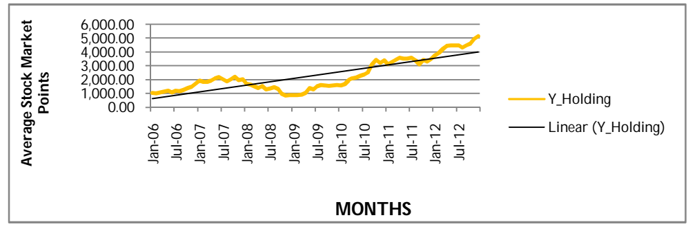
Figure 2.Time-Series Plot of the Philippine Holdings Stock Index from January 2006 to December 2012